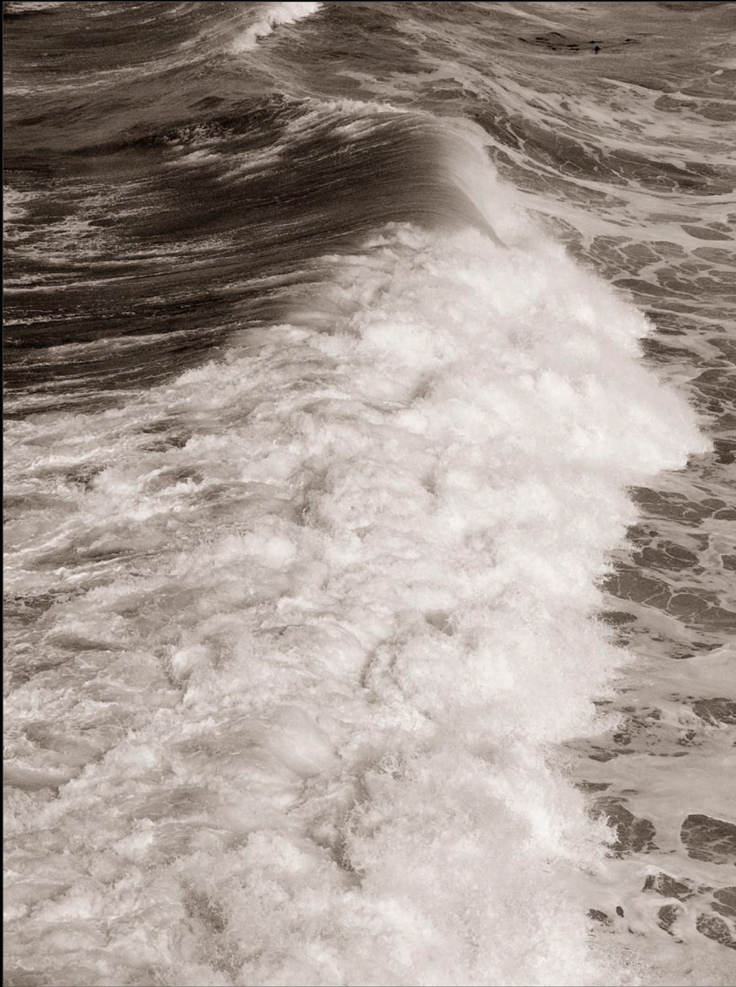
Surf, Depoe Bay