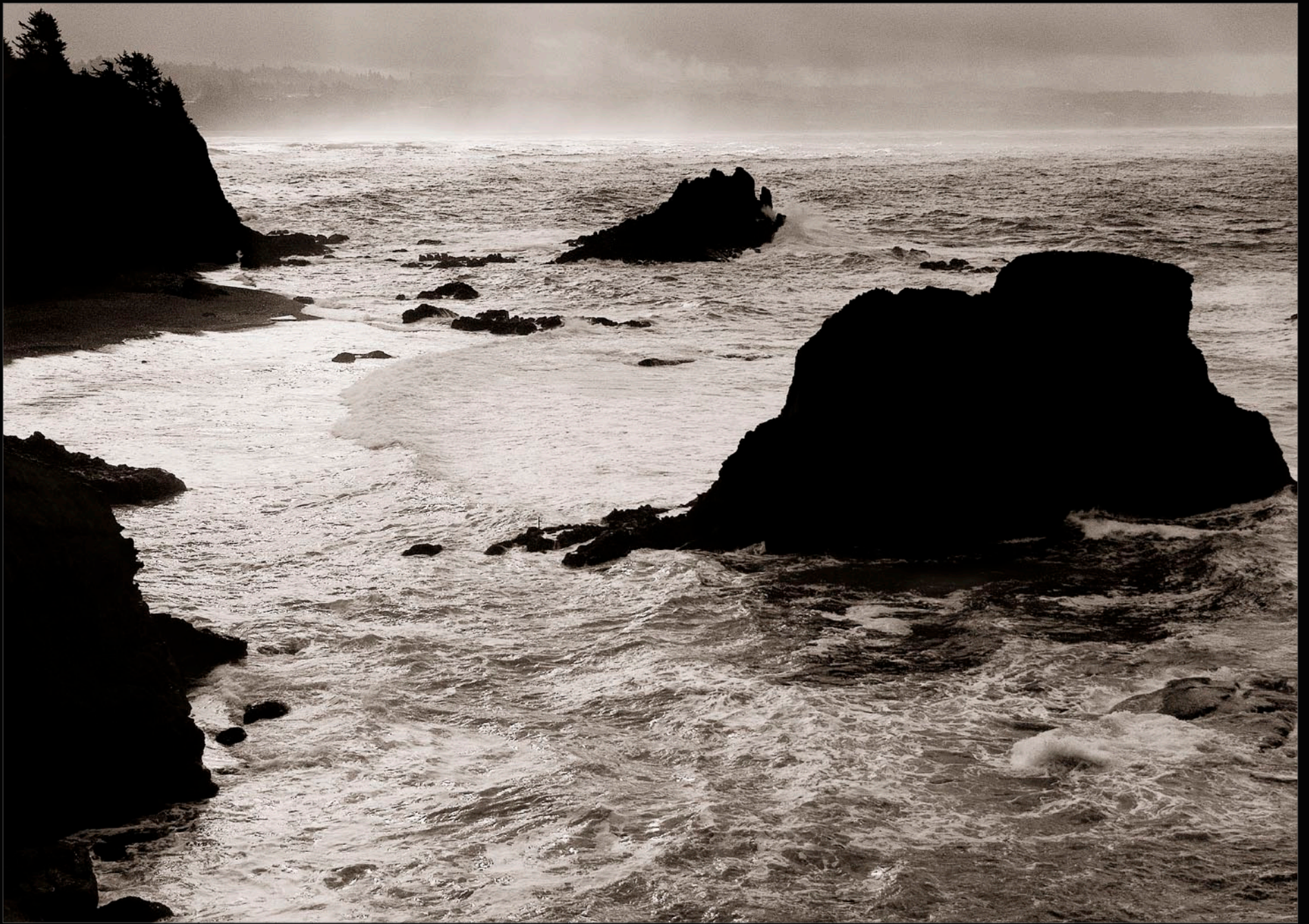
Yaquina Head Rocks and Shoreline #37