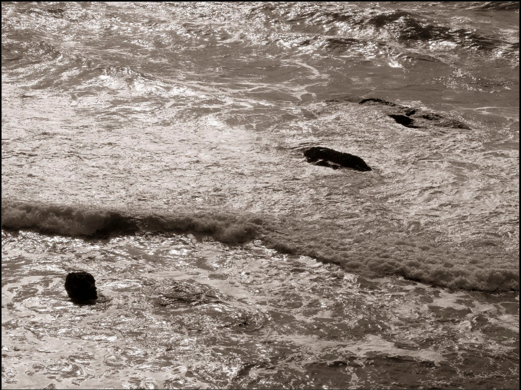
Yaquina Head Rocks and Shoreline #68