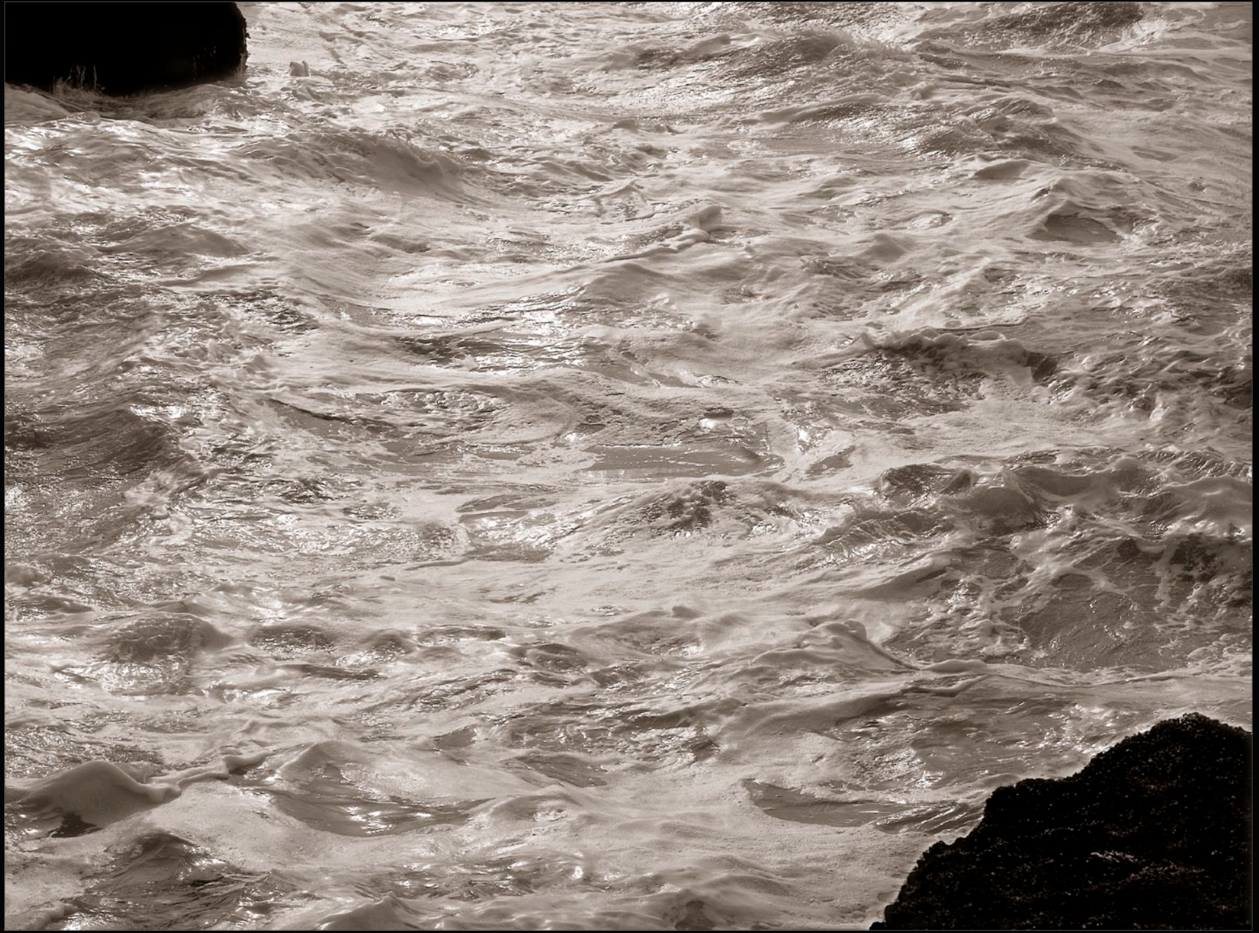
Cape Perpetua #18