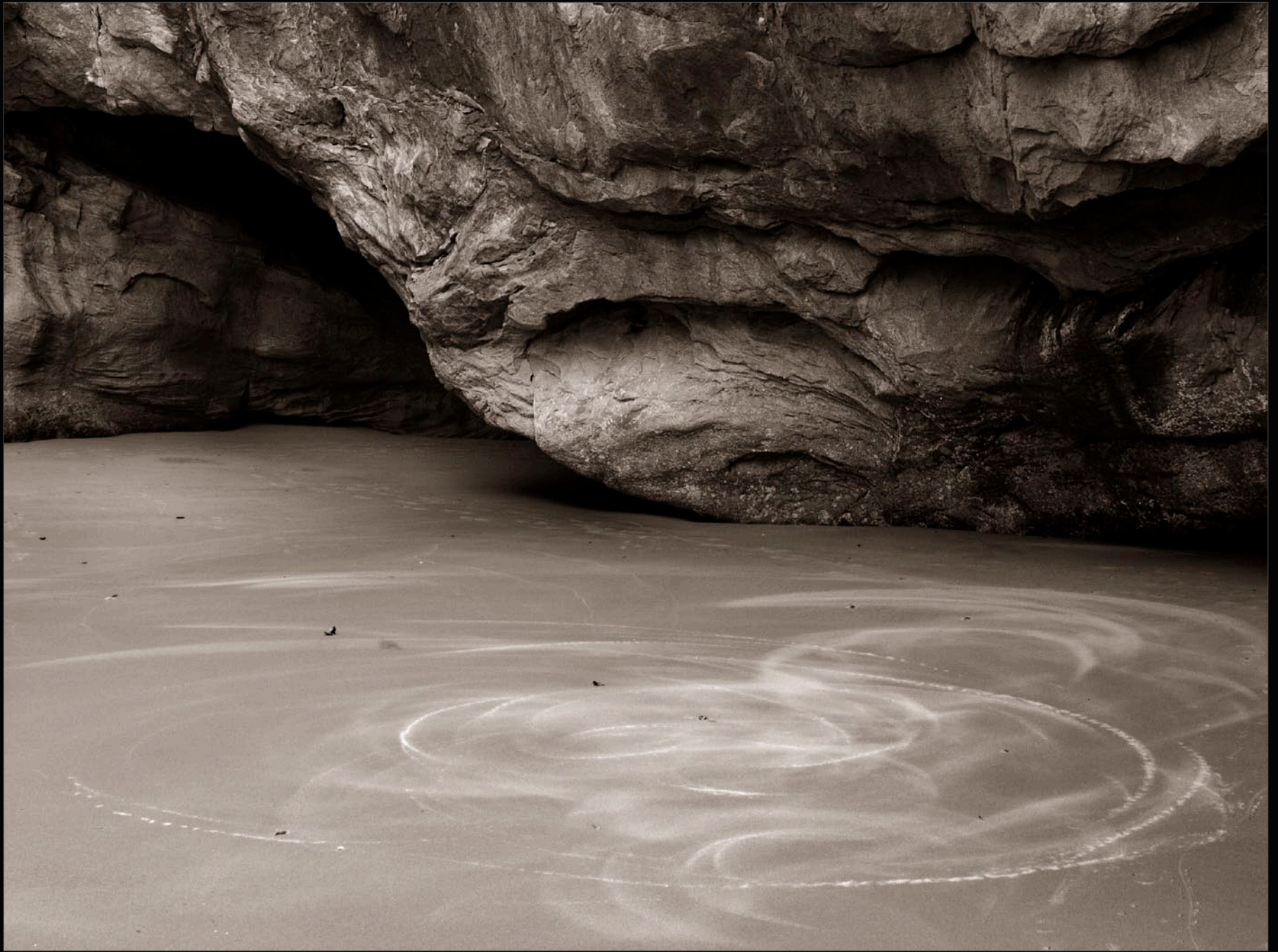
Rock Wall & Wind Tracings, Hug Point