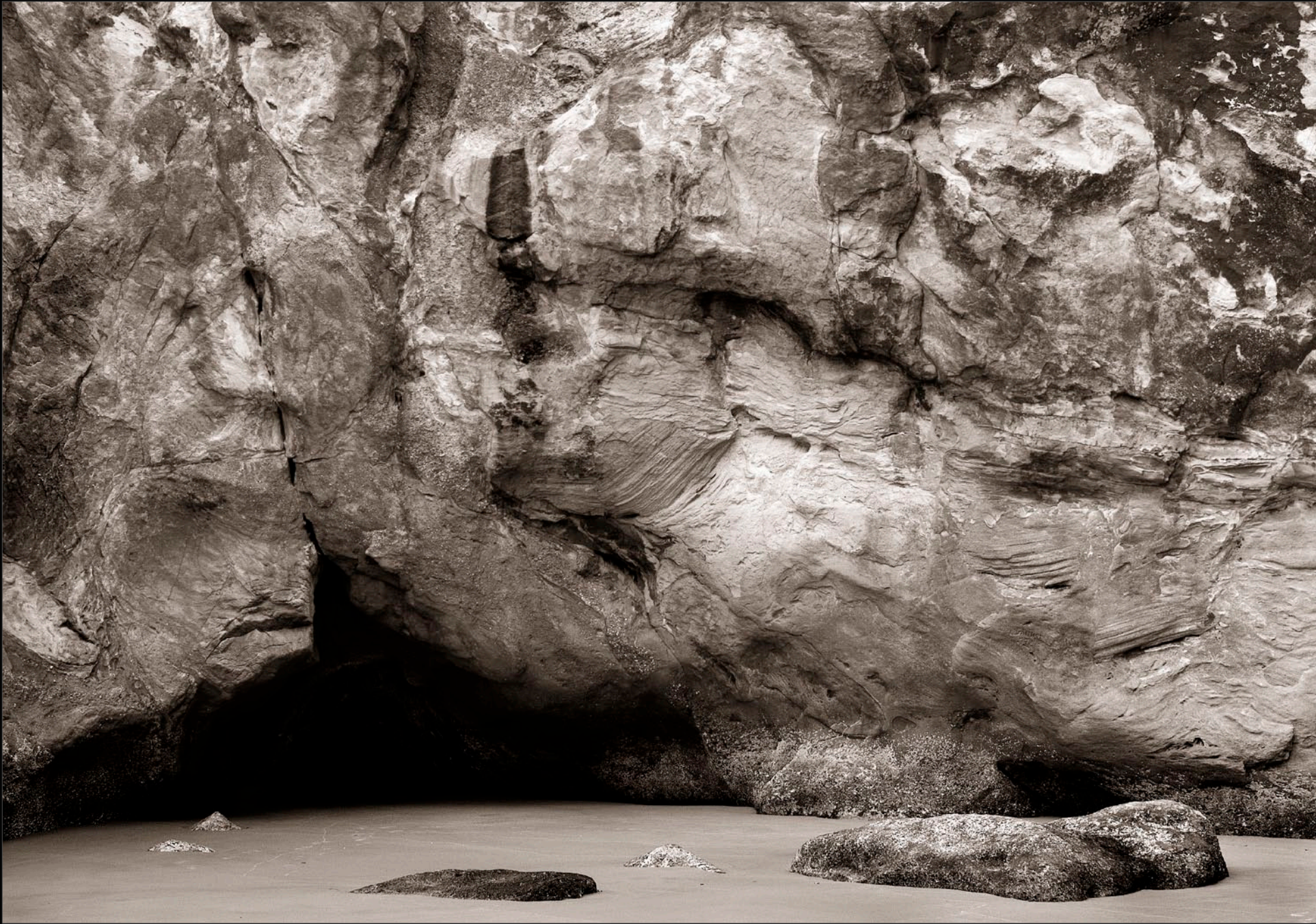
Rock Wall & Cave, Hug Point