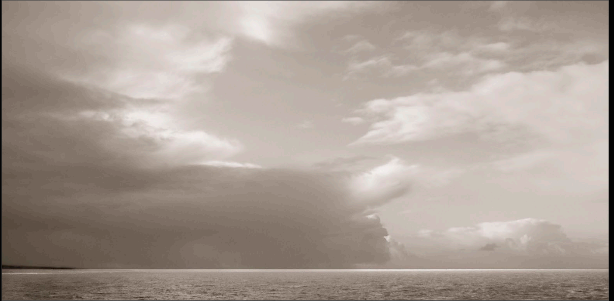
Yaquina Seas & Storm Clouds