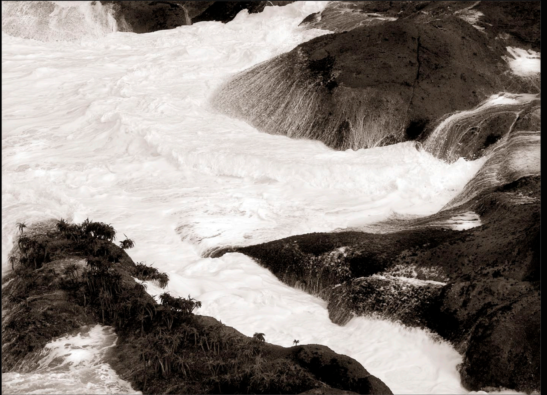
Sea Palms & Surf, Rocky Creek Wayside