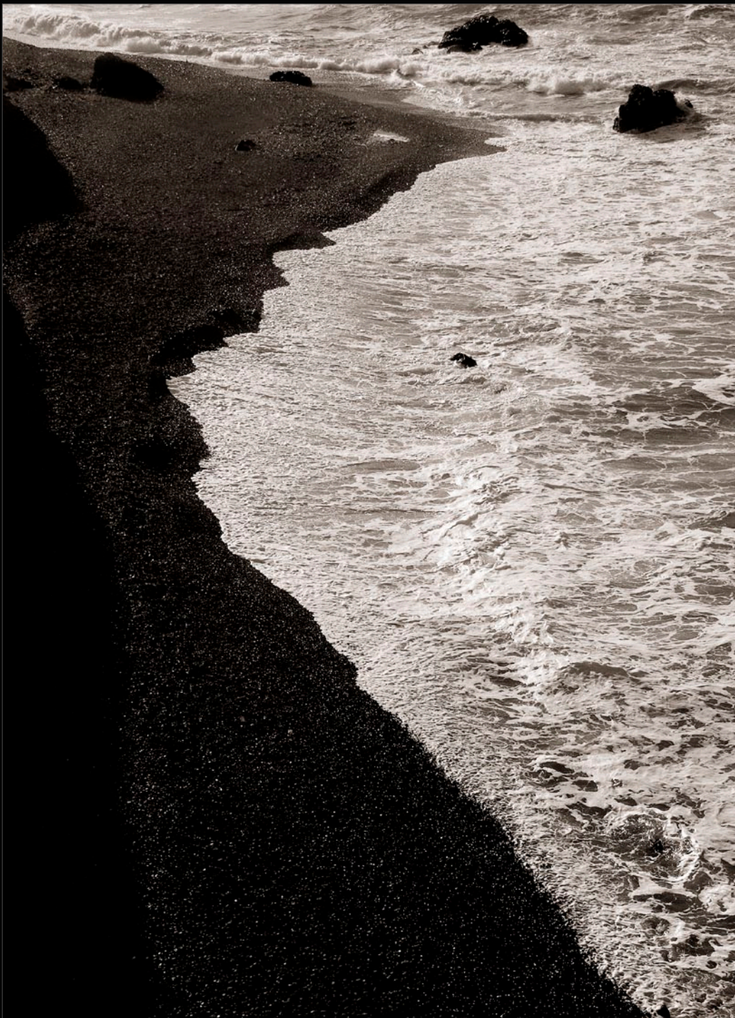
Yaquina Head Rocks and Shoreline #25