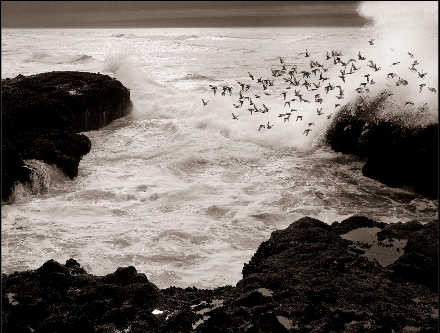
Cape Perpetua #32